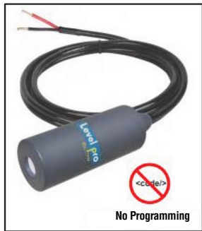
100 Series Sensor