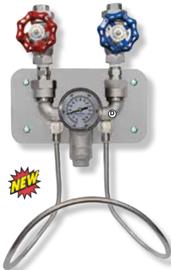
3600MST Stainless Hot/Cold Mix Unit

3600MST Hot/Cold Water unit features stainless globe valves, stainless check valves, temperature gauge, stainless mounting plate and stainless hose hook for up to 50' of 3/4" hose, (hose not included but is shown below).