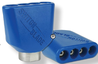
Switch Blade™ Deuce