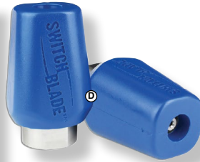
Switch Blade™ Ace