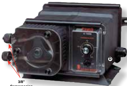
A100N Standard Model

Peristaltic Injector Pumps are the ideal choice for injecting tough-to-handle solutions that can foul conventional Pumps with check valves. Peristaltic pumps feature rollers that compress tubes in a progressive squeezing action. Precision injection at 50-100 PSI.