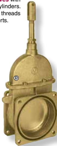
Flange x Flange Style

NOTE: "H" in the part number is for Hydraulic in this section. Different from above.