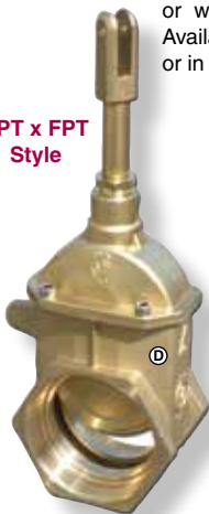
FPT x FPT Style

New improved design features a thicker gate to eliminate annoying leaks. FPT valves are rated to 60 PSI. Flange valves are rated to 45 PSI on 4" and 6" and 22 PSI on 8".