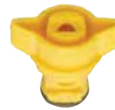
QPPA Spray Tip Yellow 5.0 GPM @ 43 PSI Use with QPPA Body