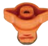
QPPA Spray Tip Orange 3.0 GPM @ 43 PSI Use with QPPA Body