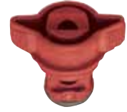
QPPA Spray Tip Red 7.0 GPM @ 43 PSI Use with QPPA Body