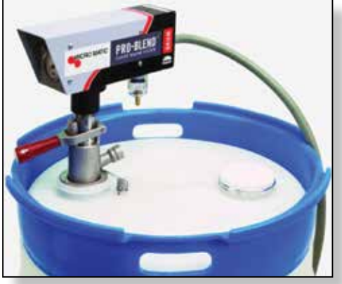
No. 7340 Air Consumption is 1-2 CFM at 40-60 PSI

This system requires that you have a 3-way RSV/RPV Drum Valve installed in your tote or drum. Size your down tube mixer for the specified vessel size. Air supply pressure is not to exceed 125 PSI. Air inlet is quick-connect 1/4" male adapter. Pro-Blend mixers come assembled with 3-Key, Viton®, 304SS Fill Coupler and air pressure regulator.