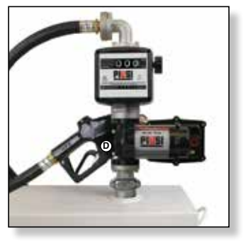
EX75 PRO KIT

A safe and reliable option for fuel transfer in potentially explosive environments. The Piusi EX75 fuel transfer pump is ideally used to deliver fuel directly to fleet vehicles, generators, heavy machinery and equipment, Over-the-Road (OTR) semi-tractors, fuel tanks, farm equipment and much more!