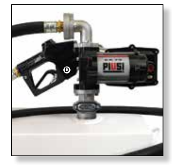
EX75 BASIC KIT

EX75 Basic Pump Kit Includes: 20 GPM fuel pump, 3/4" automatic nozzle, nozzle holder, 3/4" x 13' anti-kink delivery hose, 1" x 43" suction downtube, and flanged tank connector.