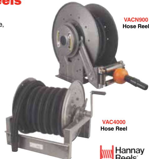
VAC4000 Hose Reel