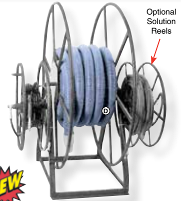
Hank Crank or 12 Volt