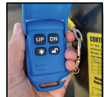
CHR1121 Key FOB Remote (One Key Fob Included with All Electric Models)