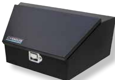
12 Gauge Carbon Steel

Features: 12 Gauge carbon steel • Black, powder-coated finish • 80 lb. gas assist door opener • Commercial, one-piece gasket to seal out elements • Tapered design • Stainless door latch with lock • Robotically welded • Made in USA.