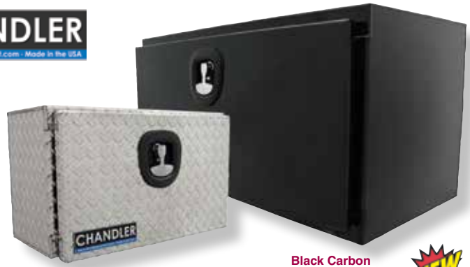
Aluminum Diamond Plate