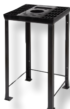
Stand for TT12 & TT25 Filter Crushers