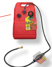
External Fuel Tank