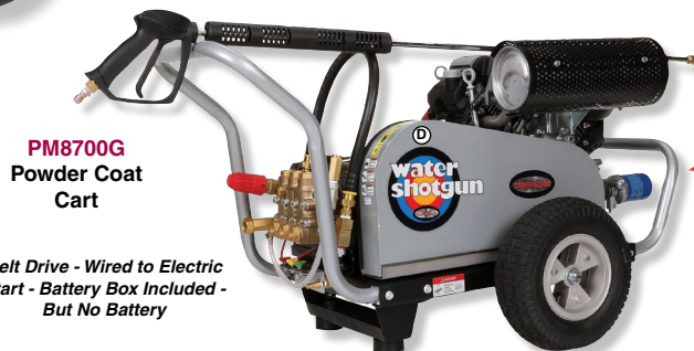
PM8700G Powder Coat Cart