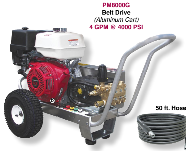
PM8000G Belt Drive (Aluminum Cart) 4 GPM @ 4000 PSI

Gas Engine Pressure Washers with pulley or gearbox driven pumps. Belt/Pulley Driven Models allow pumps to run at slower RPM for longer life. Gear Box Models allow for pumps to be direct driven but also at slower RPM. Either style is the best choice for contract cleaners or where units will be used most every day.