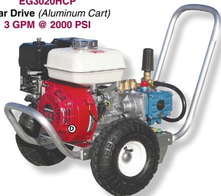
EG3020HCP Gear Drive (Aluminum Cart) 3 GPM @ 2000 PSI

Standard Features Include: Triplex Plunger Pumps • Adjustable pressure regulators • Trigger style shut-off wands • Chemical injectors • 50' hoses • Pneumatic tires • Aluminum or powder-coated frames as noted • 12 Volt starters on engines as noted.