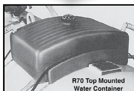
No. R70 Red Polyethylene Safety Container mounted to top of NH3 nurse tank.

R70 Water Can is a 6.9 Gallon, Red Polyethylene safety, container for mounting to the top of NH3 nurse tanks. Accessible from both sides of the nurse tank. Note: Included is a Mounting Package which contains straps for a 41" diameter tank, discharge hoses and fittings.