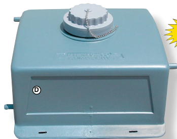
76410 TOP MOUNT