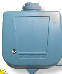
76411 SIDE MOUNT