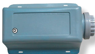
75649 SAFETY CONTAINER

AS A SAFETY PRECAUTION WATER SHOULD BE CARRIED ON AMMONIA APPLICATORS & NURSE TANKS