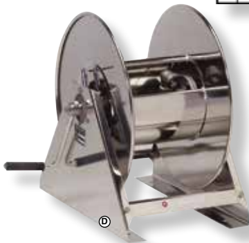
Stainless Hand Crank

HS Series Stainless Hand Crank Hose Reels from Reelcraft feature Electropolished 304L Stainless and are ideal for harsh environments. Offers maximum protection from premature corrosion. All swivels include Viton® seals, Stainless drum and frame, aluminum hubs and bronze bushings. Rated to 3000 PSI and 210°F. Both models are 19" high x 20" deep x 18-1/4" wide. ( Roller hose guides available ).