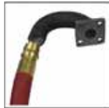
Removable Gooseneck Makes Hose Installation Easy

Features: Vibration-proof, self-locking fasteners • Heavy-gauge steel frame with all bolted, unitized construction • Full flow swivels with Aflas seals except for CA32112L and CA32118L which are Buna • Rated to 1000 or 3000 PSI as shown • Maximum temperature is 210°F. ( Roller hose guides available ).