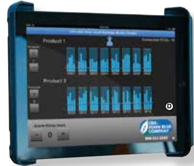
Premium System (Wireless) i-Pad® Based