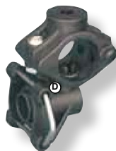
WL 41375-00 1-Way Saddle