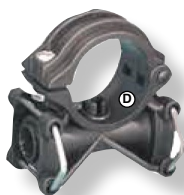
WL 41376-00 2-Way Saddle

Combo-Rate Nozzle Body Systems allow you to spray with multiple nozzles ( of the same or different sizes ) at the same location on the boom, to optimize coverage, canopy penetration and drift control. This allows flow rates and droplet sizes of multiple nozzles to be combined. Unlike conventional nozzle bodies, Combo-Rate nozzle bodies are modular. Constructed of durable glass-filled polypropylene, stainless u-clips and FKM o-rings ( Viton® available ). 10 PSI diaphragm check valves with EPDM are standard ( 4 PSI Viton® diaphragms are also available ).