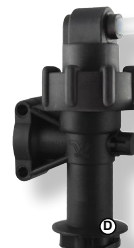
WL 41126-00 1 Way End Nozzle Body with Air Off Control