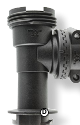
WL 41137-00 Swivel End Nozzle Body w/o nut for PWM solenoid (not included) Adjustable in 15° increments for fence-row spraying