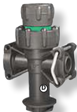
WL 41110-00 2-Way Nozzle Body with Manual Shutoff Valve