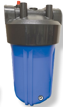
WF4124 "Big Blue"

Heavy Duty, Chemical-Resistant Polypropylene Filter Housings are designed for regular 2-1/2" or jumbo 4-1/2" sediment or carbon filters. WF1124 and WF2124 have 3/4" FPT ports. WF4124 and WF4140 have 1" ports. Leak-proof sealing rings. Pressure vents are standard. Temperatures to 125° F. Pressures to 75-100 PSI.