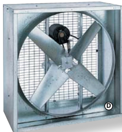
PFG Belt Drive

PFG Exhaust Fans are ideal for controlling condensation and the reduction of stagnant air in almost any application. Available in Direct Drive or Belt Drive . Galvanized housing, frame, wire guard and blades for superior corrosion-resistance in harsh environments. Single phase, 230 volt motors with thermal protection. Direct drive models feature 16" deep housings and (3) blades. Belt drive models feature 20" housings and (4) blades.