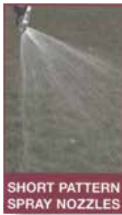
SHORT PATTERN SPRAY NOZZLES