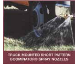
TRUCK MOUNTED SHORT PATTERN BOOMINATOR® SPRAY NOZZLES

Stainless Steel “Boominator” Spray Nozzles are the ideal choice for spraying without booms. Patented “Anti-drift” technology. Designed to produce large droplet patterns for minimal drift. Can be used to easily spray around obstacles and over uneven terrain. Superior wear and chemical resistance. No small orifices or slots to plug up.