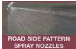
ROAD SIDE PATTERN SPRAY NOZZLES

Roadside Spray Nozzles are designed for operating heights from 18” to 48”. Wide spray distance coverage. Right hand mounting only. No kick back pattern for overlapping.