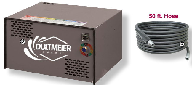
50 ft. Hose

Many industries require enclosed and covered pump systems for industrial cleaning applications. These cold water units are belt-driven and feature electric motors and General plunger pumps in a stationary, enclosed housing. All units include trigger wand, 50' of hose, high pressure detergent system, float tank, unloader valve and external on-off switch. (Other motor phase is available from those shown).