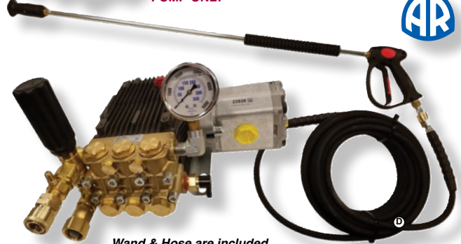
Wand & Hose are included

Kit is complete with hydraulic motor, AR plunger pump, mounting rails, unloader valve, chemical injector, pressure gauge, and quick disconnect for hose. Models come with spray wand and 50' hose as shown. A wide variety of flows and pressures are available to meet your needs. Ports are 3/4" FGHT inlet and 3/8" female quick disconnect outlet. Rated to 140° F.