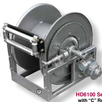
HD6100 Series with "C" Roller