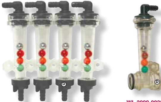
WL 3376-4 "Squeeze Pump" Monitor