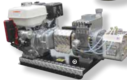
Super 6 Power Pak Direct Drive Ideal for tanks sizes 300 - 500 gallons