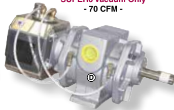
SUPER6 Vacuum Only - 70 CFM -