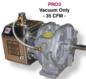
PRO3 Vacuum Only - 35 CFM -