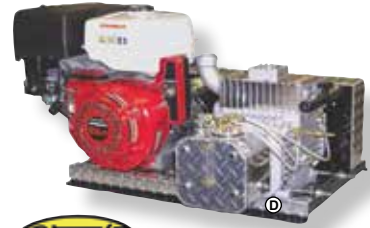
SDS 12 Power Pak Pulley Drive Ideal for tanks sizes 1000 - 2000 gallons

Standard Features: Honda GX gas engines with electric start • Diamond Plate baseplates and belt guards • Rigid assembly for minimum vibration and maximum power • Vacuum only or Vacuum/Pressure models • Wide range of CFM sizes to match your needs • Direct drive models have a centrifugal clutch for no load start up and idle. Note: Diesel engine units also available.