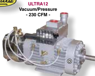
ULTRA12 Vacuum/Pressure - 230 CFM -