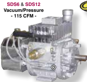
SDS6 & SDS12 Vacuum/Pressure - 115 CFM -