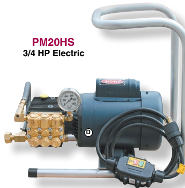
PM20HS 3/4 HP Electric

Designed to test the integrity of pipes and plumbing system required by local codes. Ideal for use with sprinkler systems or sewer lines. All units feature hand carry carts except