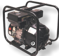
Gas Engine No. 1542P-65SPM with Roll Cage