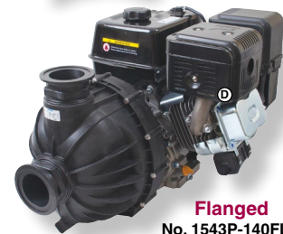
Flanged No. 1543P-140FLG