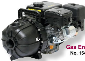
Gas Engine No. 1542P

Ideal for fertilizer & chemical transfer