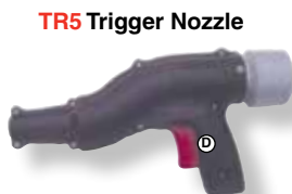
TR5 Trigger Nozzle