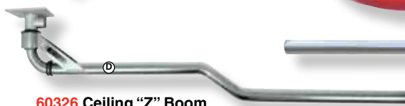
60326 Ceiling "Z" Boom