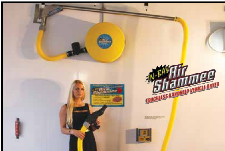
I29B Wall Boom Optional