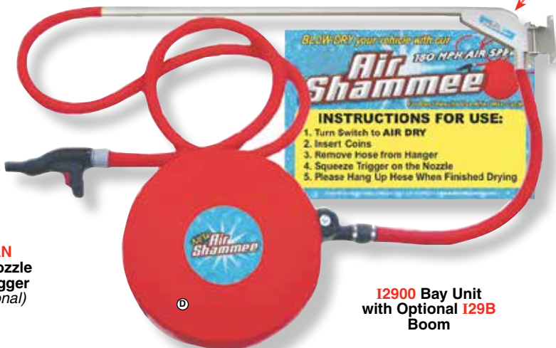
I2900 Bay Unit with Optional I29B Boom