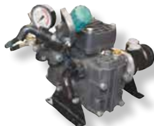
DELTA-40/HYD Hydraulic Drive