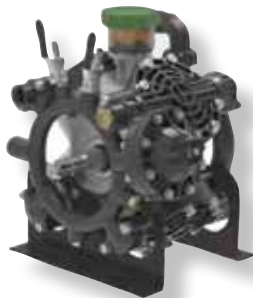
OMEGA 170 TS2C