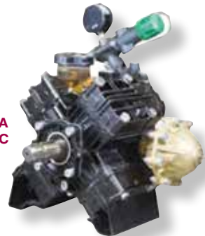
DELTA 100 1C