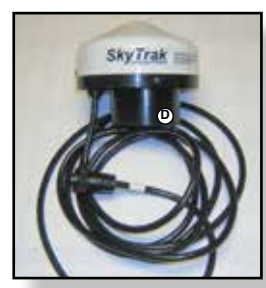
With Universal Mounting Brac