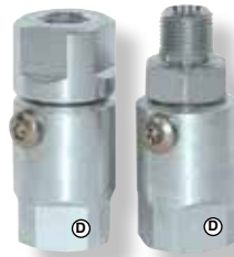
FPT Swivel MPT Swivel

Super Swivels "Inline Swivels" are designed with AFLAS™ seals for water, soap or wax solutions ( Viton® also available ). Rated for pressures up to 3,000 psi. Maximum temperature: +32° F. to +400° F. Available in zinc-plated carbon or stainless steel high quality alloy steel. Easily rebuildable. "Live" design swivels under pressure. ( For Hydraulic fluids - See Hydraulic swivels shown elsewhere on this page. )