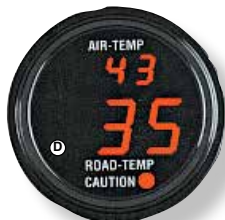
The RoadWatch LED Display

Road Watch Bullet™ should be a vital part of your anti-icing & de-icing program. It constantly displays both the air and pavement surface temperature in "real time". This allows you to apply salt and chemicals at the best rates for the conditions and make your rate changes on the go. Uses non-contact infrared technology. "Caution" light activates at 35° F. Road temp range : -10° to 200° F. Air temperature range: -40° to 150° F. 12VDC. Illuminated LED digital display. Accuracy: 2° F. Includes exterior "western" mirror mount infrared sensor with clamp, 2" diameter in-cab display and 12' shielded cable. Many options available.