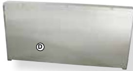
BG250SS & BG305SS Belt Guard