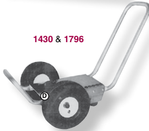
1430 & 1796