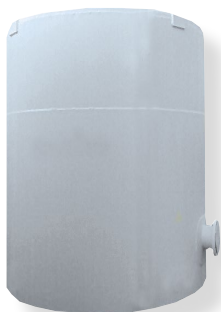
SINGLE & DOUBLE WALL VERTICAL FUEL TANKS