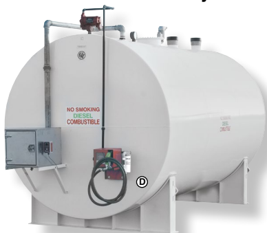
DOUBLEWALL Saddle Tanks in 4000, 4950, 6000, 8000, 10,000 & 12,000 Gallons