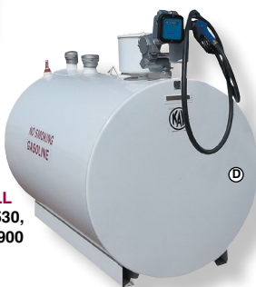
DOUBLEWALL Skid Tanks in 530, 1000, 1900 & 2900 Gallons