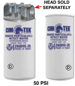
HEAD SOLD SEPARATELY

NO. 260HS and 260AHS ELEMENTS have hydrosorb filtration and completely remove all water and foreign material from the fuel. They can be used as replacement for the 200E and 200AE elements. Size is 8" or 8.65" high x 3-3/4" in diameter. Not for aviation fuels.