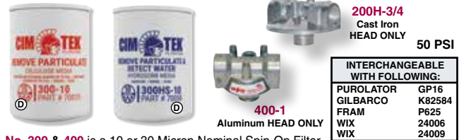
200H-3/4 Cast Iron HEAD ONLY 50 PSI