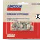
10 Fittings Per Card