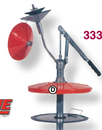
Part No. NS 333 Bearing Packer

No. 333 Portable, hand-operated, volume bearing packer for full open head pails through 6-1/2 gallon size. Includes packer, filler pump, cover, and follower plate. Can be used with bearings up to approximately 6 inches in diameter. (Pail not included) Shipping Wt. 10 lbs.