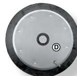
* Pump Only Shown

No. 1523 Follower Plate with rubber edge for 120 lb. drums. 1-1/2" center diameter.