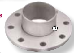
Floating Flanges (Carbon Steel Std; Stainless Available)

Note: Many Metal Hoses are Special Order and Not Returnable.