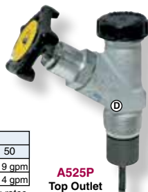
A525P Top Outlet

The A525P consists of a service valve, a filling connection and an excess flow valve.