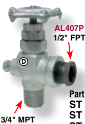
AL407P 1/2" FPT 3/4" MPT