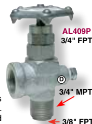
AL409P 3/4" FPT

AL409P designed for liquid withdrawal service in small applicator tanks. The port through the seat is restricted in diameter in accordance with ANSI standards. A 1/4" FPT opening is provided for the installation of any desired accessory. Liquid withdrawal rate - 28 GPM - NH 3 @ 20 psi.