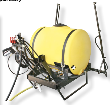
PT200R 3-Point Sprayer (Shown with options: manual controls, handgun kit & boom)