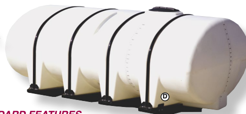
FM1610-78S Shown on Required Skid