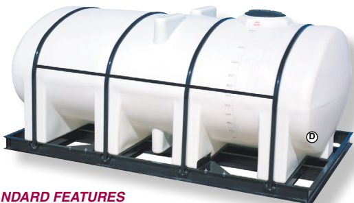
FS2350-88 Shown On Optional Skid