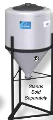
Stands Sold Separately