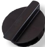
34300226 Fits 3430012 Lid