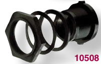
10508 2" Poly Bulkhead Fitting