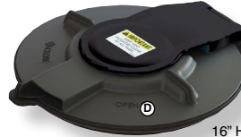
10528 16" Hinged Lid with Vent & Ring