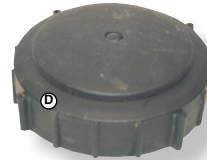
LD30-101 5" Lid with Spring Vent

Constructed of black polyethylene for durability. 5" & 7" Lids include one-way spring-loaded vent. 8", 12", 16" & 22" Lids include breather vent and fillwell ring.