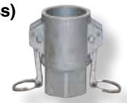
PART D Coupler Female Thread