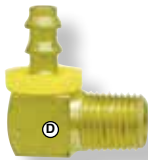
Male Elbow x Hose Barb