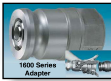
1600 Series Adapter