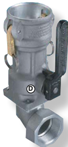
1712ES-200 90° Adapter

OPW Kamvalok® Dry Disconnect Camlock Couplings are the standard of the industry. The unique poppet design provides automatic closure in both the coupler & adapter to minimize spillage when disconnecting. Coupler end also includes safety shut-off valve. Camlock by FPT ends. Transport series (1712ES) includes 2" elbow swivel with FPT port. Standard with aluminum bodies, plated steel internals, aluminized zinc or plated steel trim & Viton® seals ( stainless bodies & other seals available ). Liquid loss is approximately one cup each end.