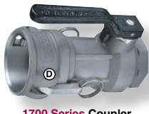
1700 Series Coupler

Note: Dry disconnects close when camlock is opened even if valve is left open.