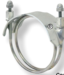
Counter Clockwise wound left hand spiral

Spiral Clamps for use on convoluted hose. Looking at the end of the hose: Use CW clamps if the hose spirals away from you in a right hand wrap. Use CCW clamps if the hose spirals away from you in a left hand wrap. Kuriyama hoses use CCW clamps. Pac Echo and Kanaflex use CW clamps. Goodyear uses both. Check your hose before ordering.