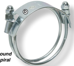
Clockwise wound right hand spiral