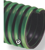
Series TG / 300G Green

Flexible EPDM Rubber Hose with green or yellow polyethylene helix combines chemical resistance with durability. Excellent cold weather flexibility. Weather resistant exterior. Lightweight and easy-to-handle. Abrasion resistant design slides easily on rough surfaces. Rated from -40 to 160° F. Full vacuum rating to 4" size at 68° F. Sold in rolls, cut to length and fitted assemblies. Red & Blue also available.