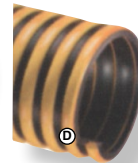
Series TY / 300Y Yellow

NOTE: CUT LENGTHS SOLD IN 5' INCREMENTS ONLY