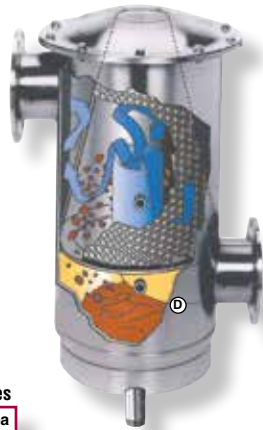
4", 6" & 8" Models

These unique Filter Systems feature a conical screen element that gives the filter a self-cleansing ability and the advantage of large screen area providing high capacities with low pressure loss. Debris is collected in a chamber below the screen for periodic flushing through a fitting in the bottom of the filter. Note: Side Flush Models are available as a Special Order. Filters include two 1/4" gauge ports.