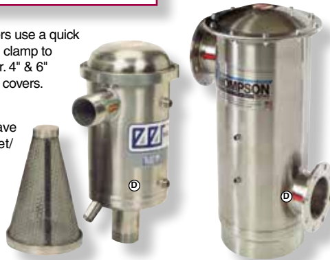
2" & 3" Models

4", 6" & 8" Sizes have flanged connections.