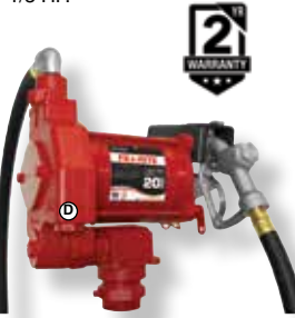
FR700 Pump (Less Meter)