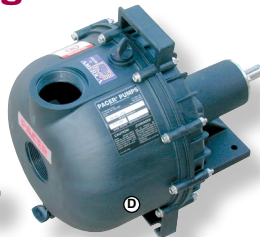
Poly Pump mounted on cast-iron bearing pedestal

Pedestal Pumps are available in 2" and 3" sizes for long coupled applications with gasoline engine or electric motor power. Pumps must run at 3450 RPM. (Heavy-duty Cast Iron Bearing Pedestal and EPDM seals are standard). The "I" Series Models are available in an epoxy coated or stainless housing. Connections on the "I" Series are 2" MPT and 1-1/2" FPT ports. The clamping band holds the pump housings together and permits easy take-down for cleaning and maintenance. SE2JB and SE2JV Series are high flow pumps with Buna or Viton® seals. See performance chart upper right side of this page (2" High flow models). Temperature Range: -10° F. to 130° F.