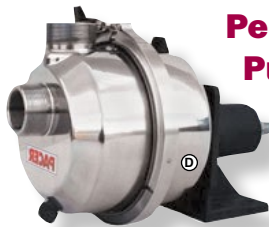
Stainless Pump mounted to cast iron bearing pedestal